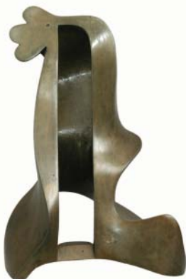
Blaze Krstanoski Blazeski "Hera" - cast aluminium.