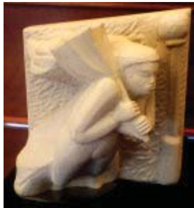
Myles Raine "Gale" - Stone and Stainless Steel

Myles Raine received the Latham's Australia Prize of $500 worth of stone carving tools for "Gale".