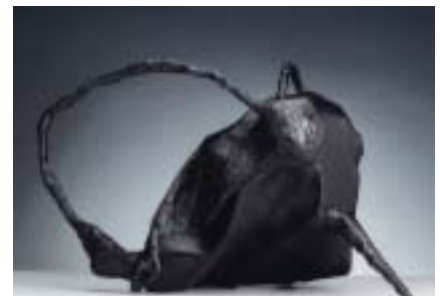
Maria Aguilera-Mendoza "It's the Oxycontin that's keeping me up" - bronze