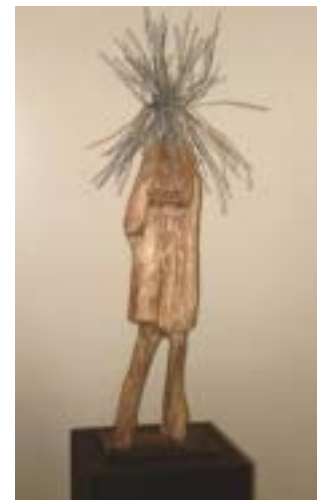
Pin Hsun Hsiang "Naughty Girl II" - Blue Gum and Wire

Pin Hsun Hsiang received the Sculptors Society Prize for Figurative Sculpture for "Naughty Girl II"