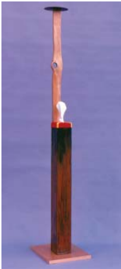
Wolfgang Gowin "Trophy IV" - Mixed media

victory and can be of great value and highly prized. Overall, it is an intriguing piece which requires some guidance. However, Gowin's use of pleasing colour, materials and proportions are sufficient to entertain the viewer and lead us to question.