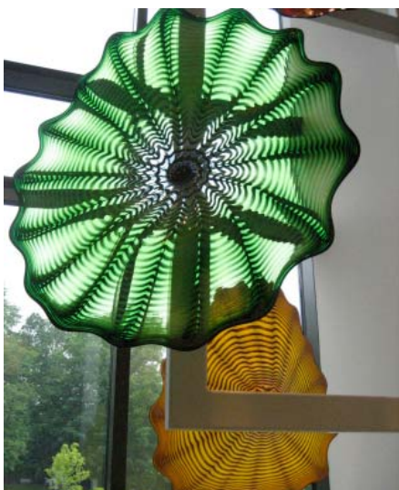
A glass sculpture by Dale Chihuly

Above: Blaze Krstanoski-Blaseski's "wave", bronze (96 x 136 x 23 cm)